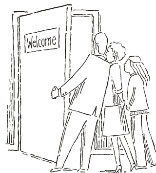
New Member Class

Please join us on Sunday, February 12 and February 26 at 11 a.m. in Room 18. We will begin with a simple meal and children are invited to attend.